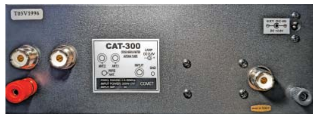
Figure 2 — The Comet CAT-300 rear panel.

*The actual current was only about 20 mA. I suspect that the original CAT-300 used an incandescent lamp for meter illumination. When this was changed to LEDs, apparently the current spec was not revised.